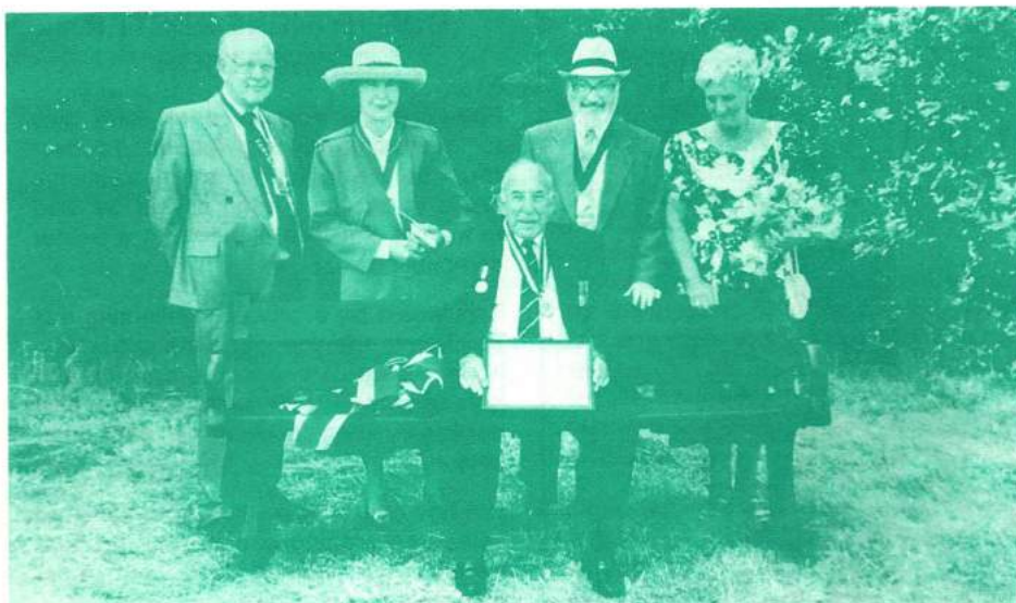
VJ DAY - the seat in the Orchard.

May we offer our congratulations to the Chairman for this great effort.