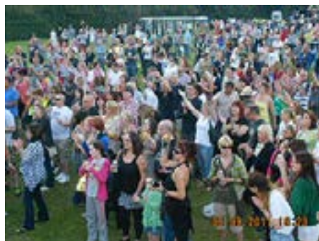
The crowd at 7.25pm

I have lived in Croxley for 18 years and today was by far and away the best community event I have ever seen, what a fantastic day!