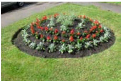
Flowerbed at Watford Road

By the time this edition of the Pump is published, we shall be thinking of winter and the plants we hope to put into the Watford Road beds and various other sites around Croxley.