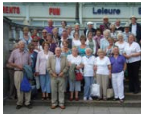
29 June 2011

The Parish Council's yearly pensioners outing went to Brighton. This outing is one way the Parish Council can show its appreciation to the older members of our community who have contributed via their taxes and other means towards the well being of us all.