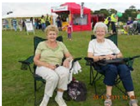
Enjoying the day

Well done all. 4 adults attended. Look forward to next year. Karin